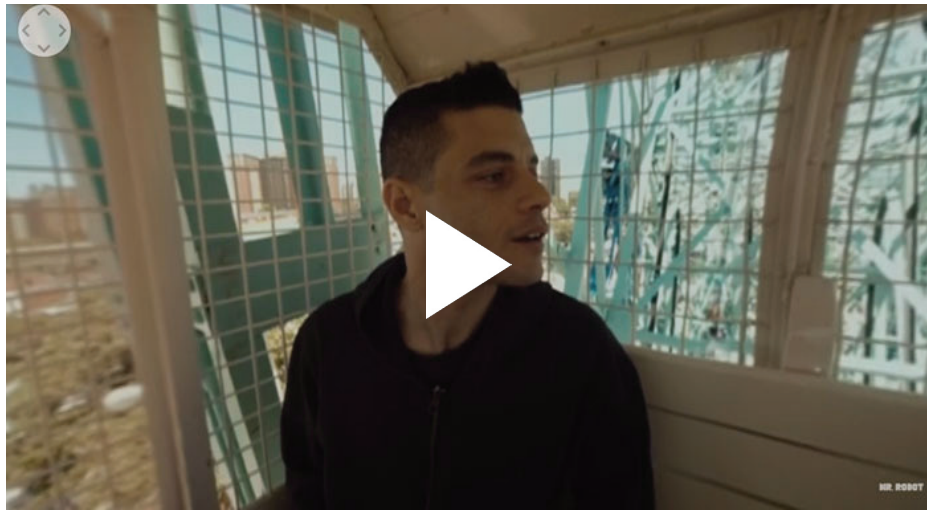
Mr. Robot: Virtual Reality Experience - 360°

In an exclusive "flashback" 360-degree VR episode on YouTube, fans of the USA Network's hit psychological thriller "Mr. Robot" get to step into the world of the show like never before, experiencing a pivotal moment from lead character Elliot's past from a unique and powerful perspective that only 360-degree video can provide.