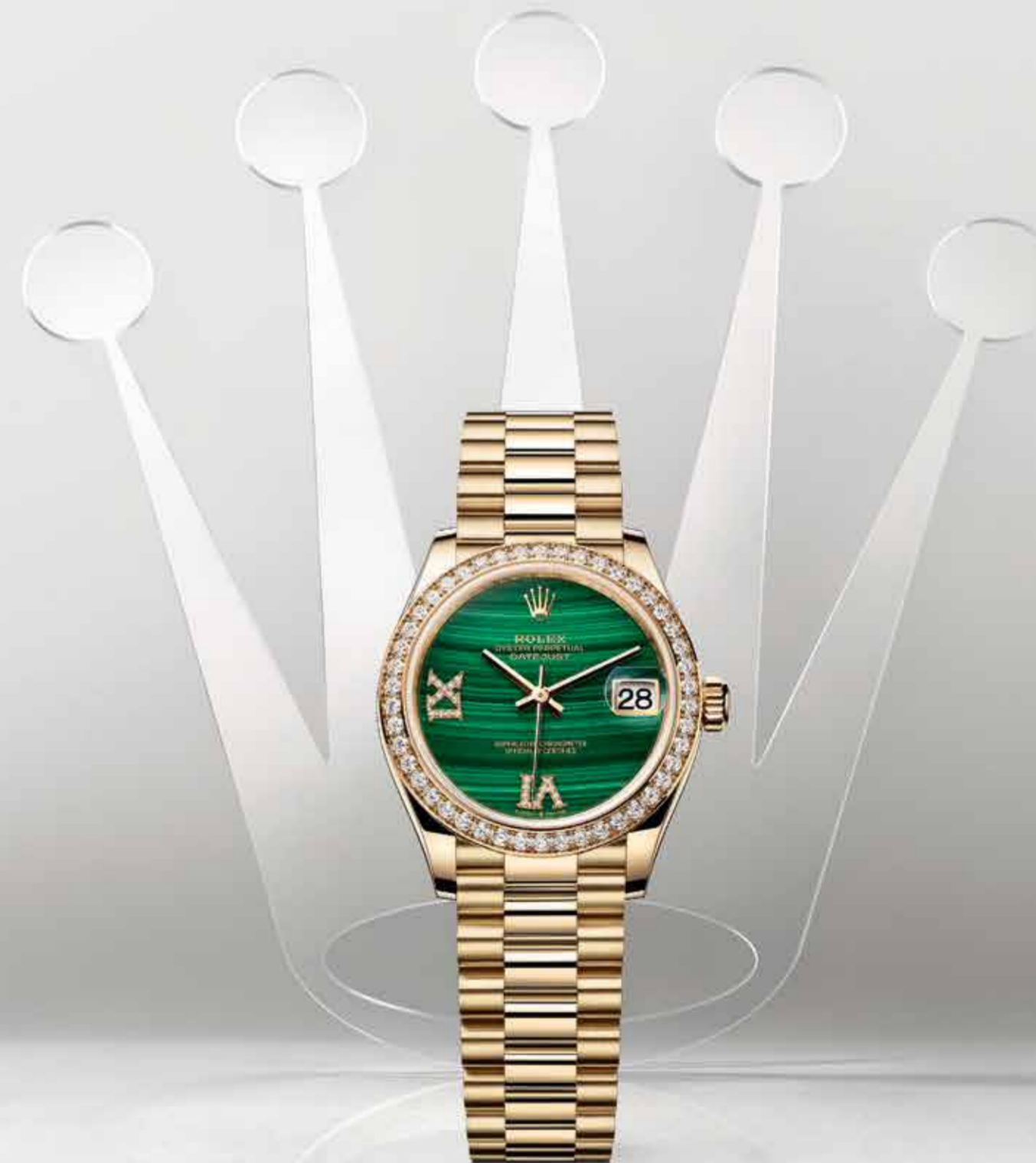
OYSTER PERPETUAL DATEJUST 31

Combining timeless elegance with a passion for perfection and the highest-quality materials, the value of a Rolex is as long-lasting as the timepiece itself. It doesn't just tell time. It tells history.