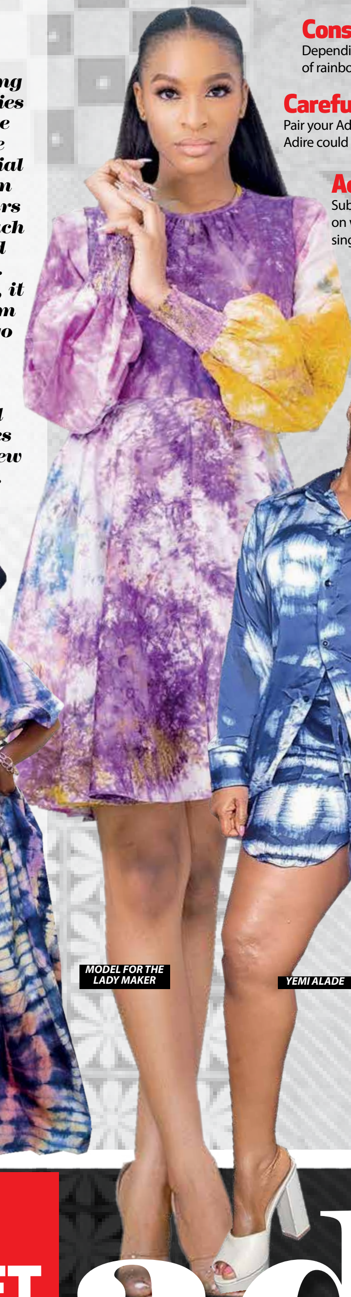
MODEL FOR THE LADY MAKER