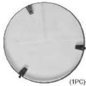
Glass Table with Metal Ring