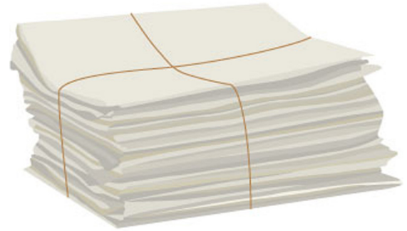
Figure 1: A stack of scrap paper.

You say to her, “But Mia, that's a total waste of paper! You could draw another picture on the other side or think of a craft you can do with the paper. For example, we can make sandals from old paper. Should I show you how that goes?”