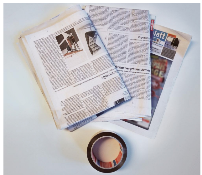
Figure 2: Required materials.