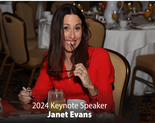
2024 Keynote Speaker Janet Evans