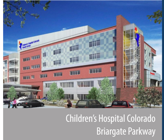
Children's Hospital Colorado Briargate Parkway

Ninguna otra instalación en el sur de Colorado pueden ofrecer este nivel de atención pediátrica a las madres embarazadas. El Centro de salud para la mujer de Peak Vista se enorgullece de anunciar que comenzaremos a brindar servicios de parto a todos los pacientes en UHealth Memorial Hospital North en la primavera de 2019. ¡Estamos emocionados de ser parte de esta iniciativa!