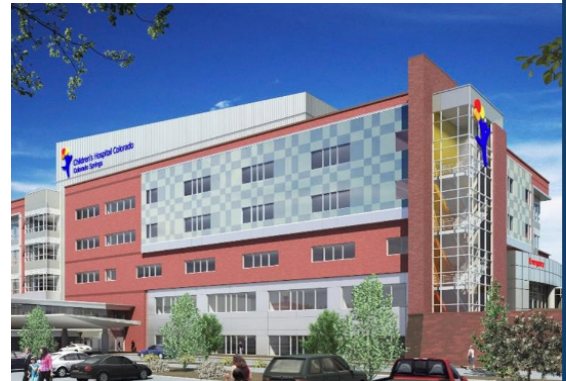
Children's Hospital Colorado Briargate Parkway

No other facility in Southern Colorado can offer this level of pediatric care to expecting mothers. The Peak Vista Women's Health Center is proud to announce we will begin delivering all patients at UHealth Memorial Hospital North in the Spring of 2019. We are excited to be a part of this initiative!