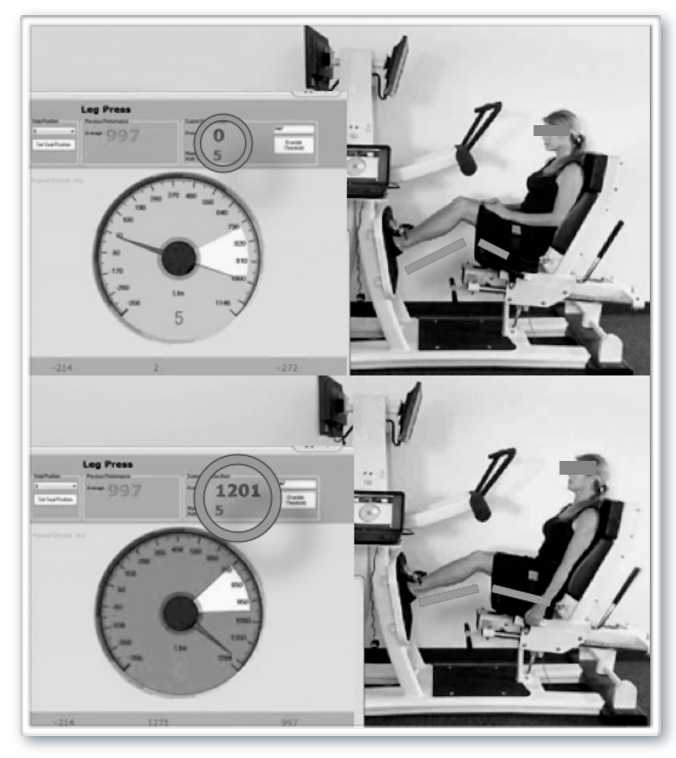
Above, a post-menopausal female subject is achieving leg/hip loading of 1200lbs./545kg. This is 10 multiples of her bodyweight. In the movement, the seat fixture does not move, nor does the foot plate. The movement seen is from compression

Results: Mean peak force/loading for subjects was 9.18(+/-2.63 SD) MOB (hip/legs) and 3.13(+/-0.79 SD) MOB (spine). Since different hospitals and radiology offices were used to gather DXA data, not all subjects had both hip and spine T-scores, and weeks/ sessions of using OL were not uniform, the results are presented in a case report format, depicting pre and post DXA of hip and spine. The BMD (g/cm2) measures in the subjects increased an average of 7.02% in the hip and 7.73% in the spine. The BMD increases that occurred reached statistical significance from pre to post DXA scans ANOVA (P < 0.001).