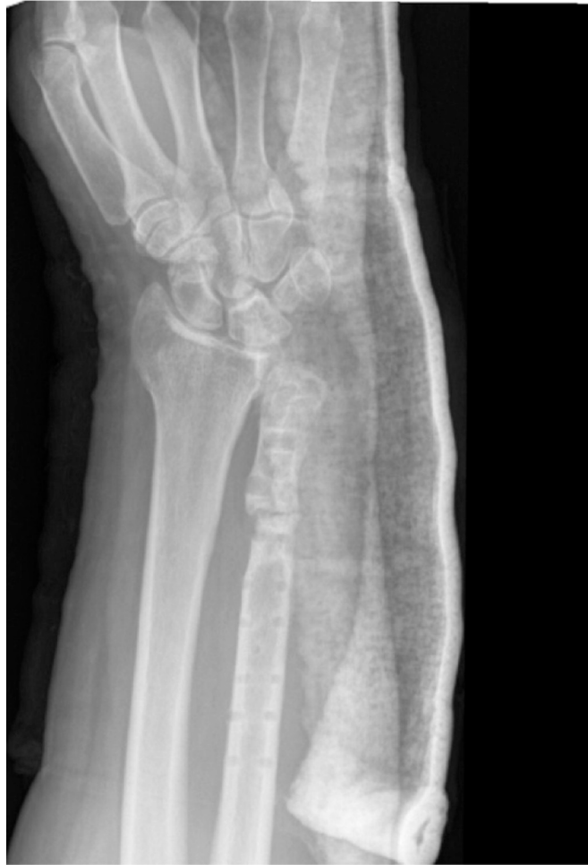
Fig. 2. This image shows that the failed revision surgery resulted in a structurally compromised distal ulna and unstable DRUJ.