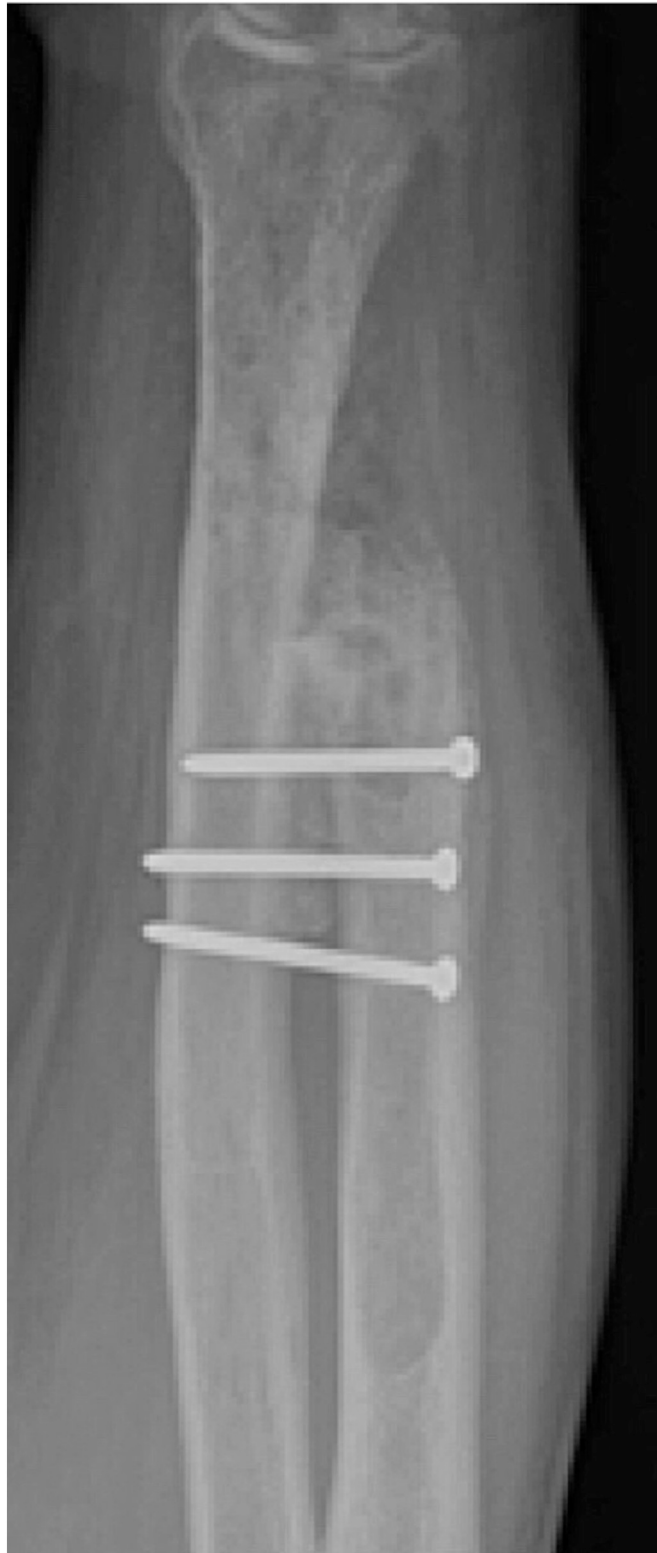
Fig. 4. This image reveals the subsequent outcome procedure of a fused ulna and radius once the APTIS implant was removed.