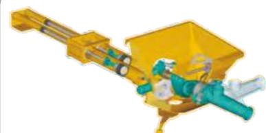
Worldwide Preferred 'S' Valve Technology