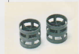
FLEXIBLE - IN & OUTLET