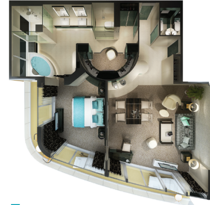
H2 The Haven Deluxe Owner's Suite with Large Balcony. Sleeps up to four.