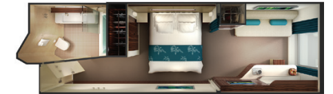
O4 Family Oceanview. Sleeps up to four.