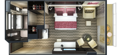
H4 The Haven Courtyard Penthouse with Balcony. Sleeps up to three.