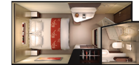
IF Inside. Sleeps up to four.