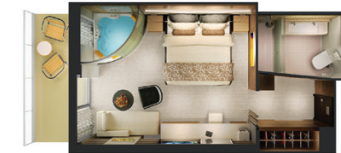
H5 The Haven Spa Suite with Balcony. Sleeps up to two.