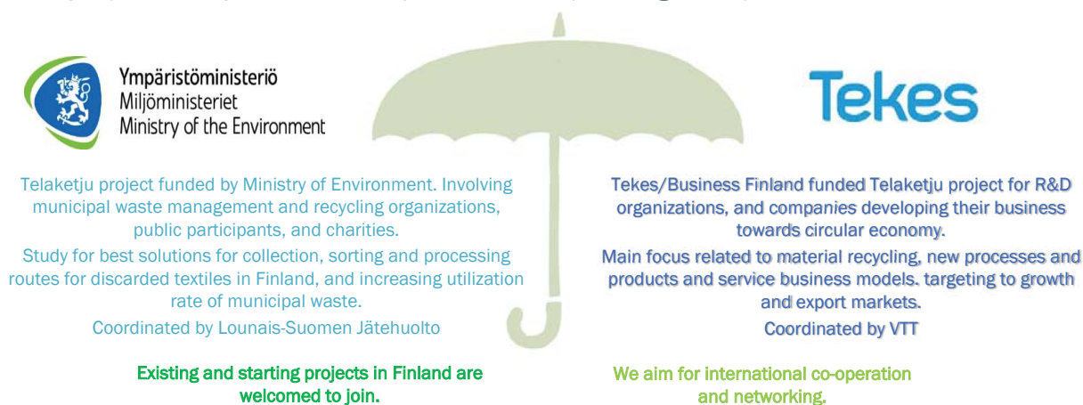
Figure 1. Projects funded by Ministry of Environment and Tekes/Business Finland are main actions within Telaketju R&D Action in 2017-2018

Telaketju R&D action started 2017 via two projects (see Figure 1) doing close co-operation and having common R&D actions. Main funding bodies for years 2017-2018 are Ministry of Environment and Tekes/Business Finland. Altogether 32 organizations are involved within these two projects as partners and /or funders (see Figure 2).