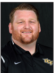
Bryan Hill Equipment