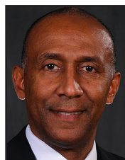
JOHNNY DAWKINS Head Coach Third Season