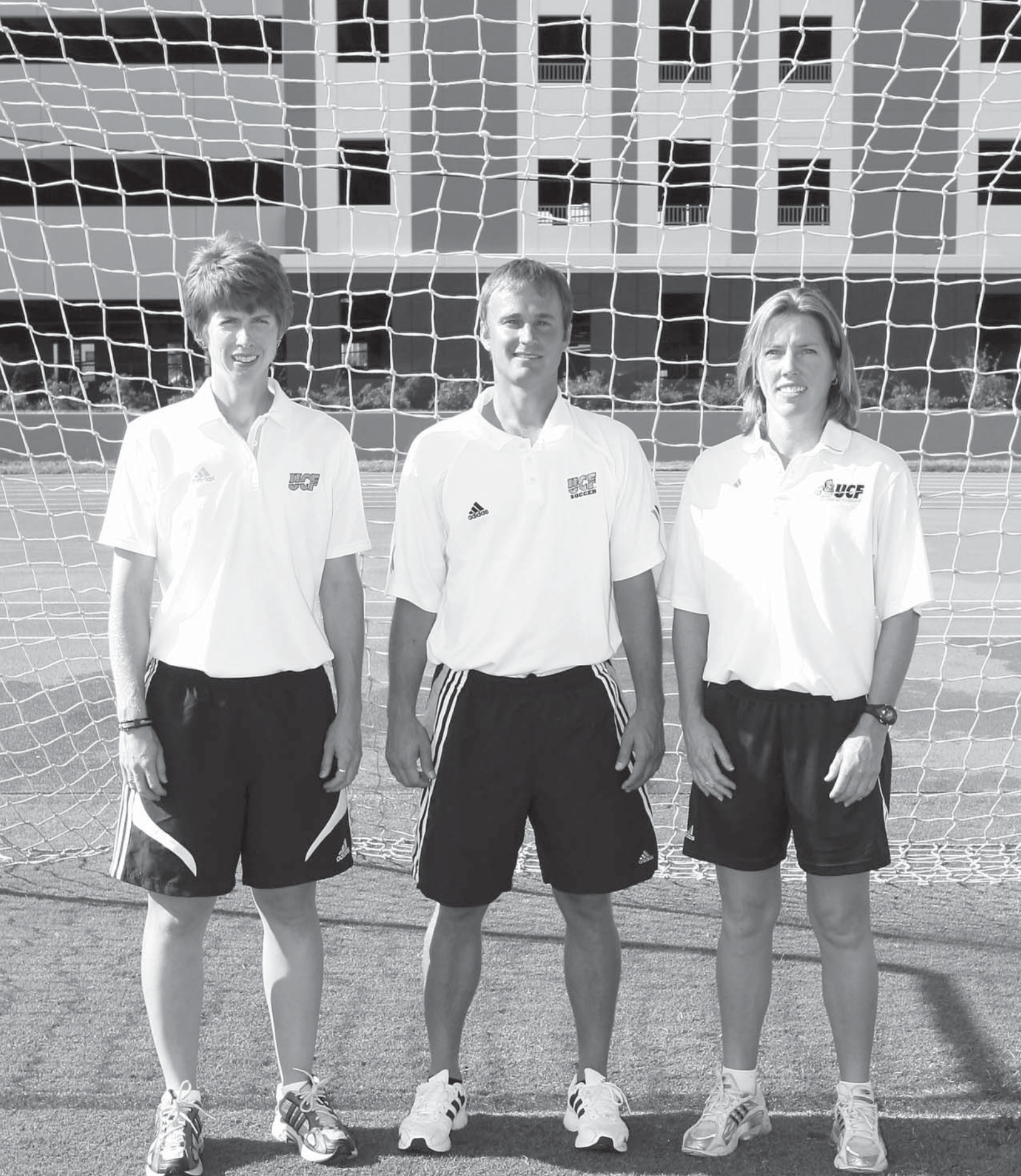
Golden Knight Staff