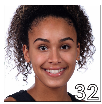
F • 6-3 • FR Orlando, Fla.