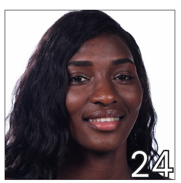
F • 6-1 • R-SR Dakar, Senegal