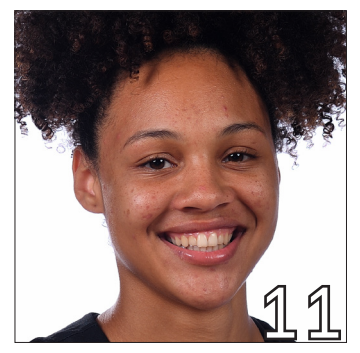
G • 5-8 • SR West Palm Beach, Fla.