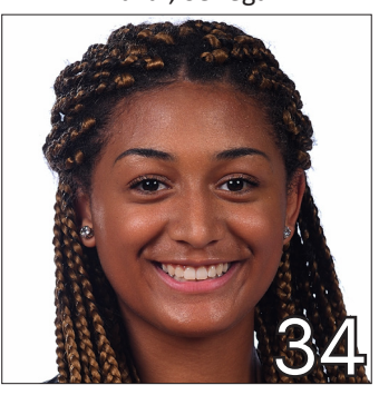
F • 6-3 • SR Easton, Mass.