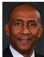
JOHNNY DAWKINS Head Coach Third Season