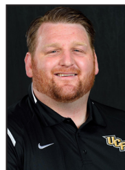
Bryan Hill Equipment