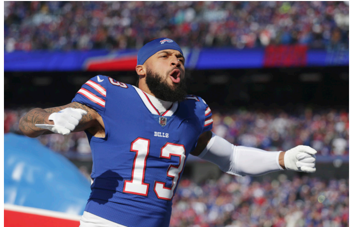
Buffalo Bills Wide Receiver Gabe Davis