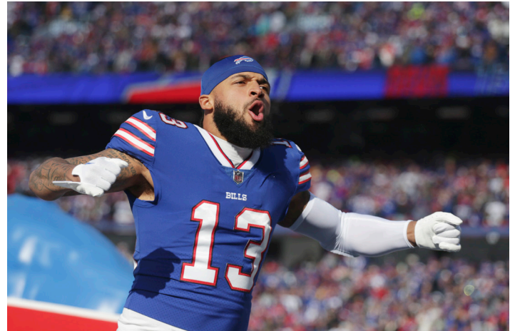
Buffalo Bills Wide Receiver Gabe Davis