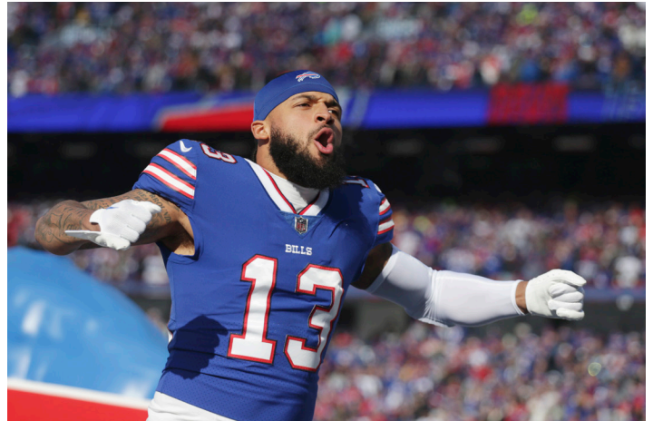
Buffalo Bills Wide Receiver Gabe Davis