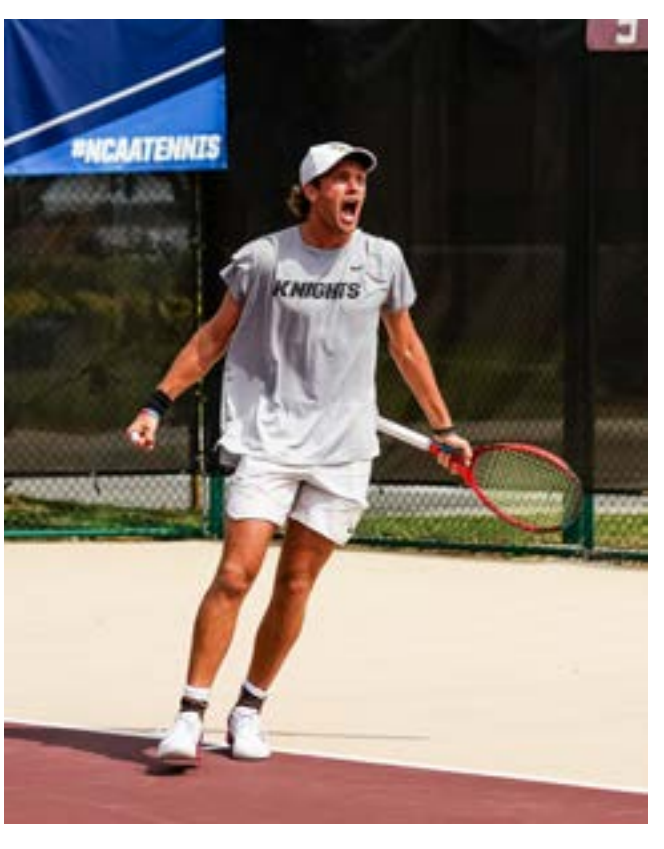
-Defeated 23rd ranked Florida for

the first time in program historyAdvanced to Second Round for second time in program history