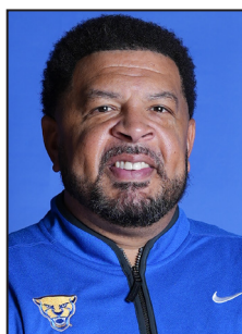
Jeff Capel Head Coach