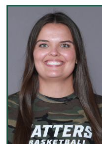
DPS Madison Pack Third Season