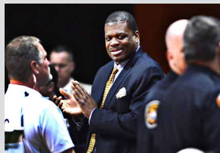
Hall of Famer Bernard King (1975-77) visited the Vols this week and addressed the team Tuesday night.