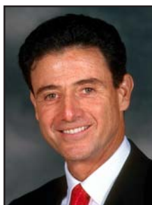
Rick Pitino Head Coach