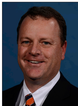
TIM HORTON RUNNING BACKS