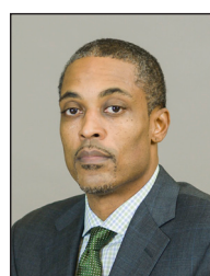
Rod STRICKLAND ASSISTANT COACH 2nd SEASON