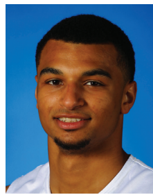
23 Jamal Murray Fr. / G / 6-4 / 207 Kitchener, Ontario