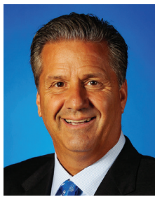
John Calipari Head Coach Seventh Season