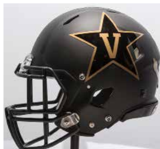
BLACK 2011 intro; matte finish in 2014, enlarged "StarV" decal added in 2015