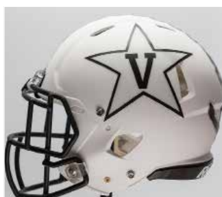
WHITE 2012 intro; matte finish, enlarged "StarV" decal added in 2015