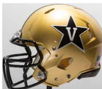
OLD GOLD No design change to helmet that was introduced in 2002