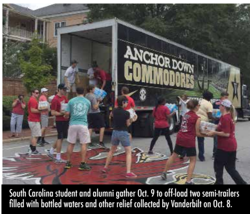
South Carolina student and alumni gather Oct. 9 to off-load two semi-trailers filled with bottled waters and other relief collected by Vanderbilt on Oct. 8.

With the Palmetto State faced with historic flooding, Vanderbilt Athletics asked Nashville-area residents to band together and help fill its football equipment truck with bottled water and generators. The response