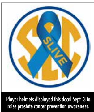
Player helmets displayed this decal Sept. 3 to raise prostate cancer prevention awareness.

Vanderbilt-Ingram Cancer Center experts are also onboard for this important awareness and prevention campaign. VICC provides multi-disciplinary care for men seeking information, screening options and leading-edge treatment for prostate cancer. Men who want to know more about their risks for prostate cancer or who are seeking care may schedule an appointment at VICC by calling toll free 1-877-936-8422.