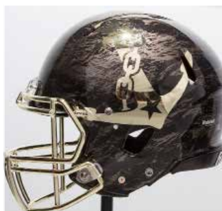
DEEP WATER Ocean-inspired HGI alternate design introduced this year