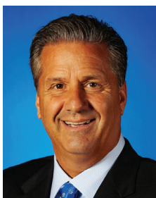
John Calipari Head Coach Seventh Season