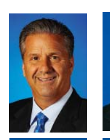
John Calipari Head Coach Seventh Season