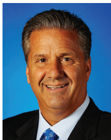
John Calipari Head Coach Seventh Season