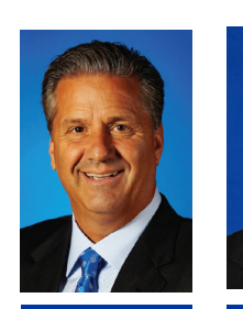
John Calipari Head Coach Seventh Season