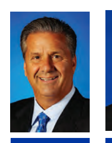
John Calipari Head Coach Seventh Season