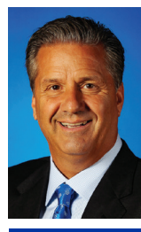
John Calipari Head Coach Seventh Season