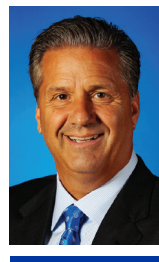
John Calipari Head Coach Seventh Season