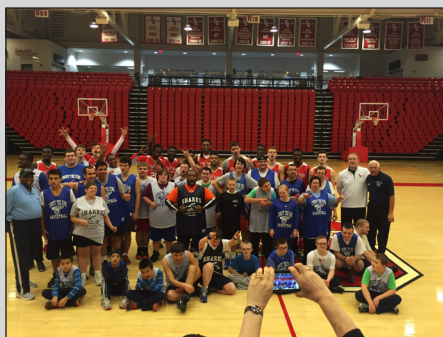
The Stony Brook men's basketball team hosted its seventh annual Special Olympics clinic on Sunday, December 13