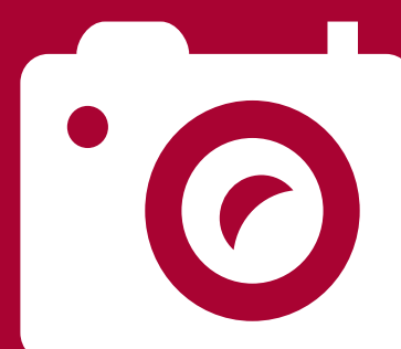
CAMERAS/CAMCORDERS CAMERA LENSES CAN NOT BE LONGER THAN 6"