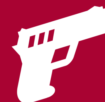
FIREARMS & WEAPONS