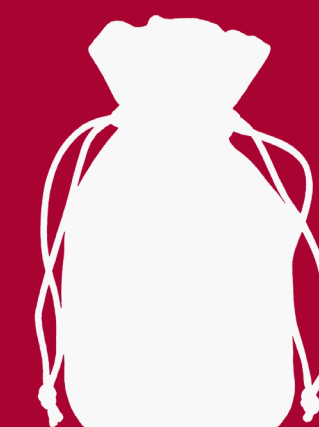
DRAWSTRING BAGS OR FANNY PACKS