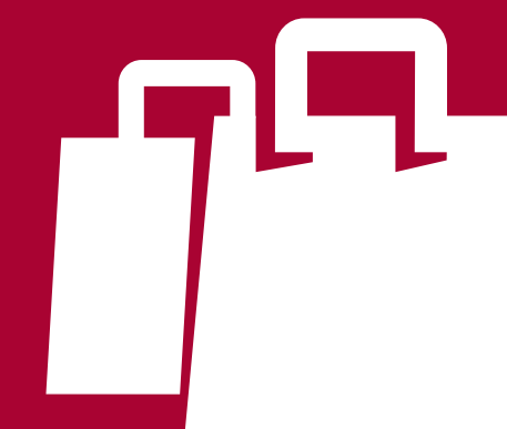
NON-CLEAR TOTES OR PRINTED PATTERNS