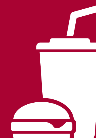
OUTSIDE FOOD & DRINKS