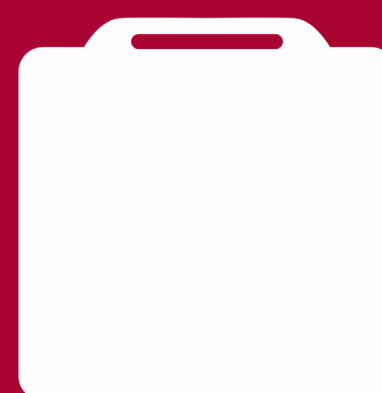
SEAT CUSHIONS LARGER THAN 16" OR WITH ZIPPERS, POCKETS OR COMPARTMENTS