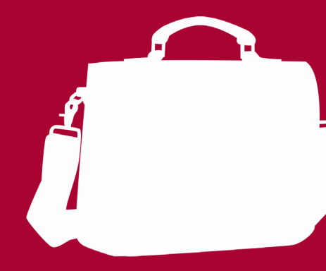
BINOCULAR OR CAMERA BAGS