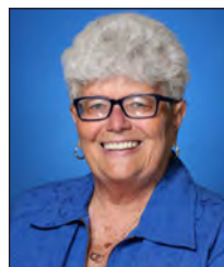
Lin Dunn Assistant Coach First Season