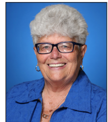
Lin Dunn Assistant Coach First Season