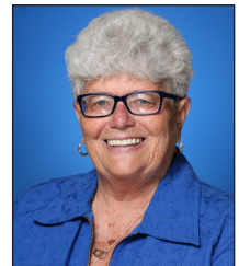
Lin Dunn Assistant Coach First Season