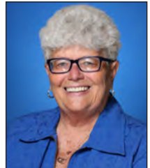
Lin Dunn Assistant Coach First Season