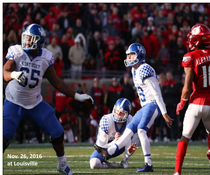
Nov. 26, 2016 at Louisville