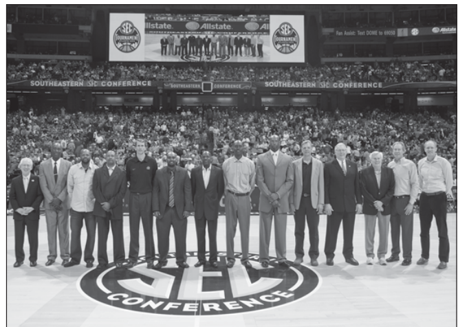
2014 SEC Basketball Legends