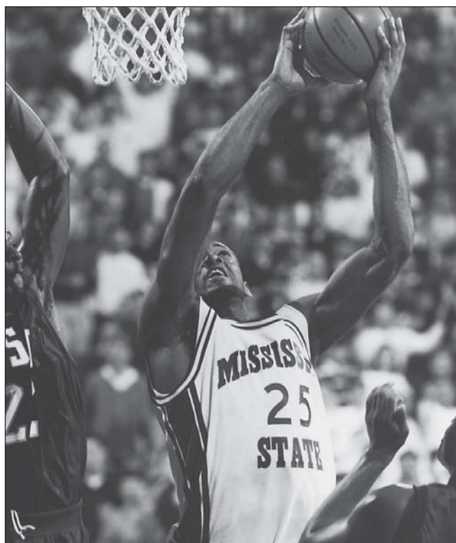
All-SEC performer Erick Dampier helped guide the Mississippi State Bulldogs to their first-ever SEC Tournament title with an 84-73 win over Kentucky in 1996.

**Only six teams participated due to World War II