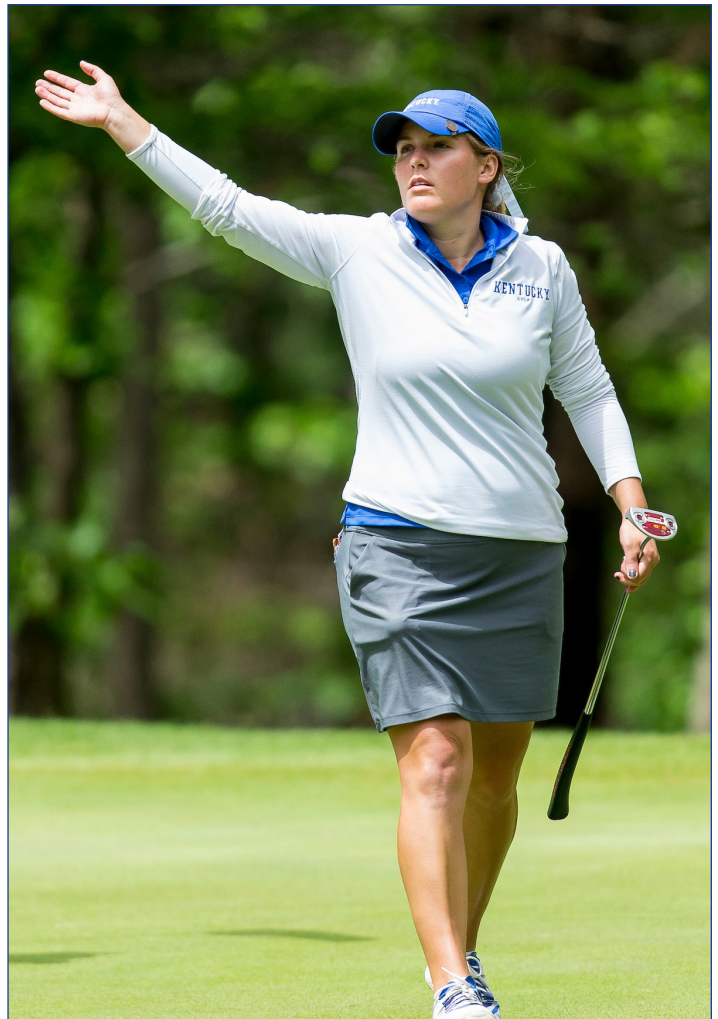
Jordan Chael posted three straight top-10 finishes in the fall, including firing a career-low 65 in the third round of the Ron Moore Women's Intercollegiate.