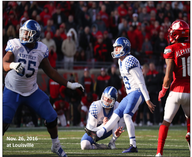
Nov. 26, 2016 at Louisville