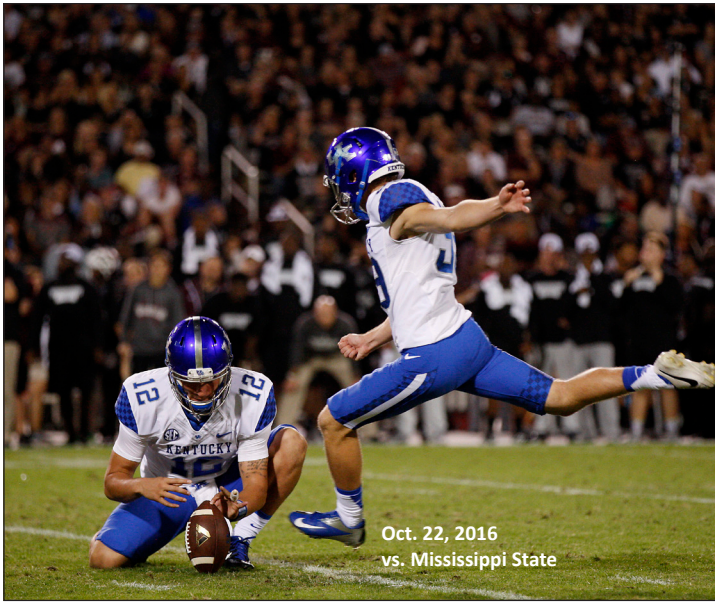
Oct. 22, 2016 vs. Mississippi State