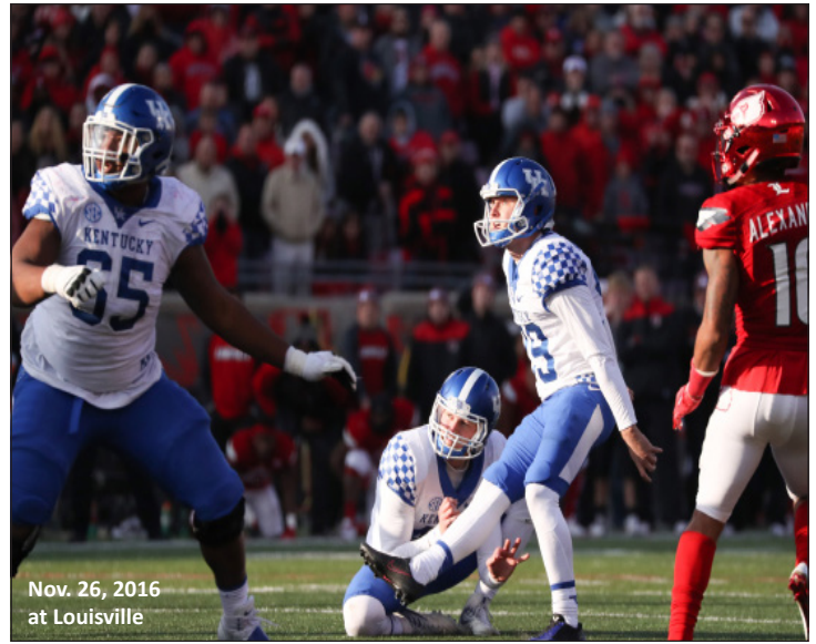
Nov. 26, 2016 at Louisville